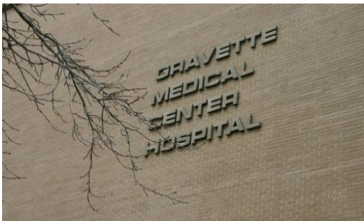
Caption: The OCH Gravette Hospital

among the hospitals examined. Interviews revealed patterns among the hospitals with respect to shifts in self-pay to private and Medicaid payment sources and reductions in uncompensated emergency department (ED) visits and inpatient stays. Hospitals also reported that while the volume of ED visits remained steady or slightly increased, the volume of patients presenting with lower levels of acuity decreased. This suggests movement toward more effective use of primary care.