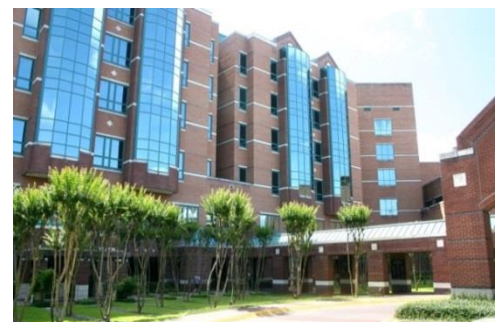
Caption: The CHRISTUS St. Michael Health System

CHRISTUS reports that while ED use at their Texarkana facility increased overall by nearly 5 percent, the volume of